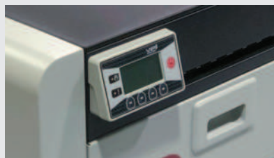
EASY TO USE BACKLIT LCD CONTROL PANEL