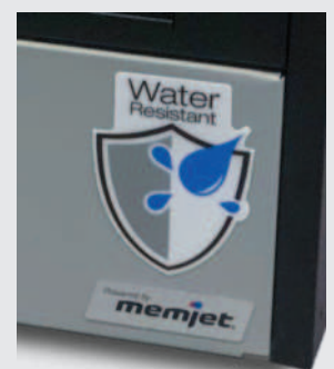
WATER RESISTANT INK FEATURING MEMJET TECHNOLOGY

Suitable across a multitude of industries such as food, beverages, agriculture, home care, pharmaceutical, beauty, hospitality and many more!